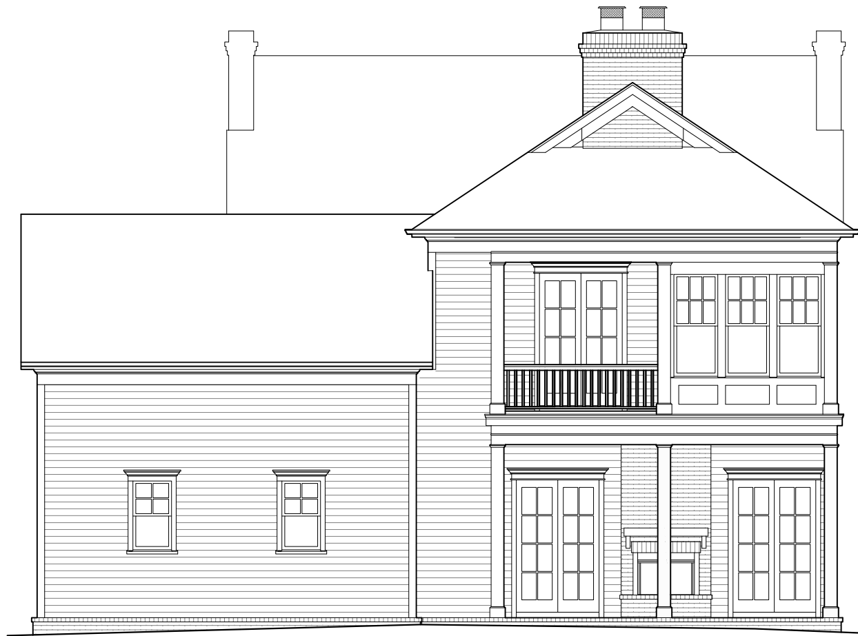
2 REAR ELEVATION 1/8" = 1'-0"