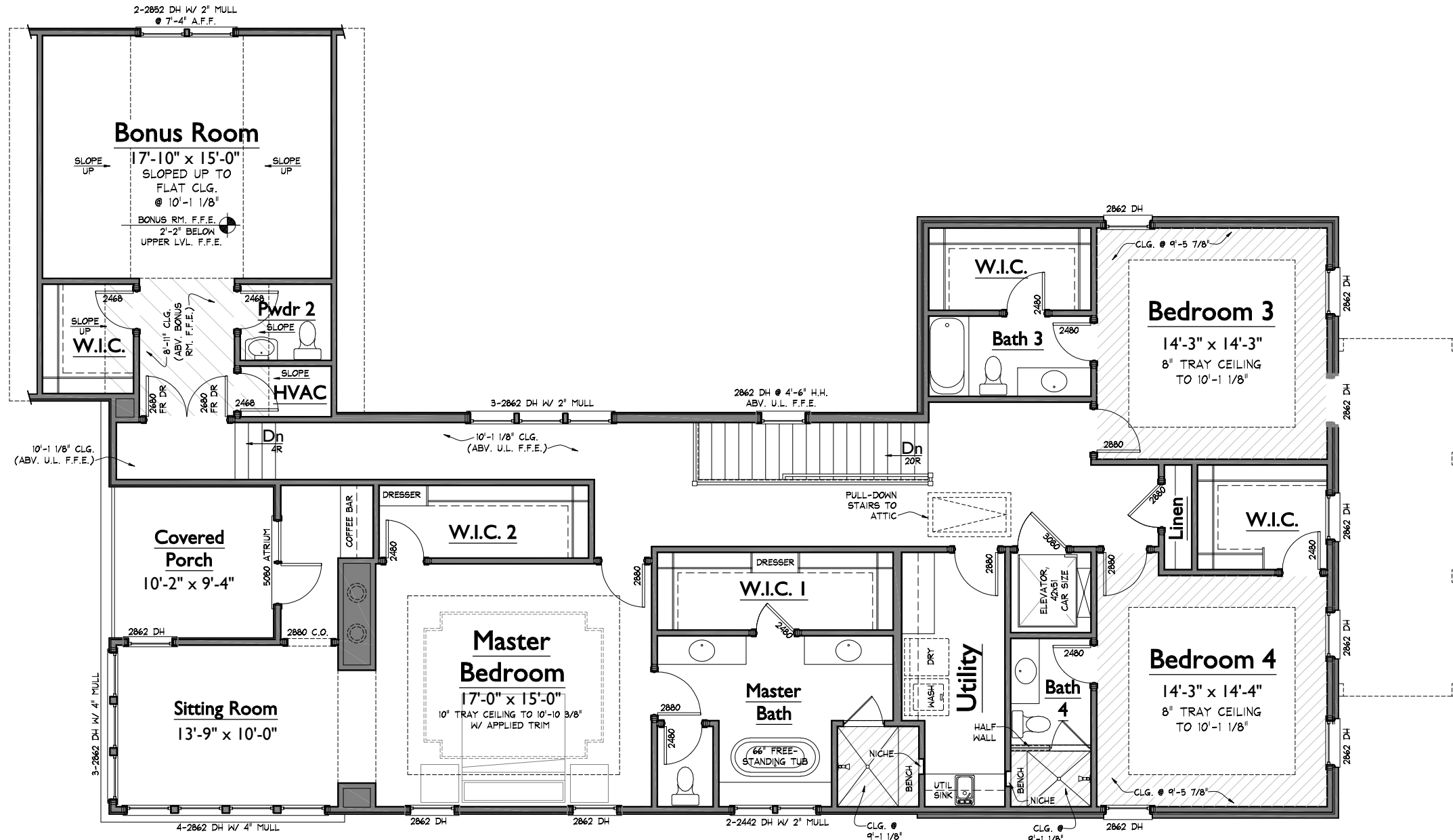
1 UPPER LEVEL FLOOR PLAN 1/8" = 1'-0"

SPLENDOR RIDGE LOT 009 149 SPLENDOR RIDGE DRIVE SR009_plan3 LAST CHECKED: 03.05.2021 JRP