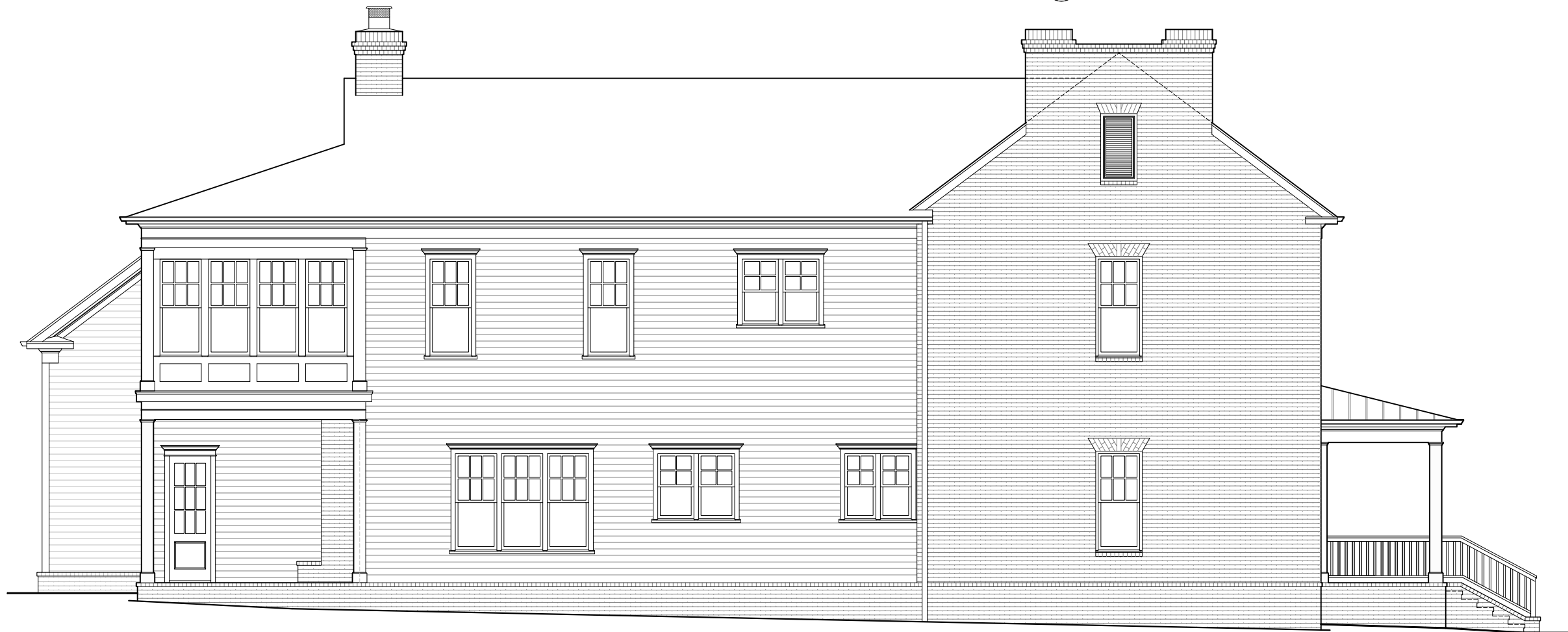
1 LEFT ELEVATION 1/8" = 1'-0"