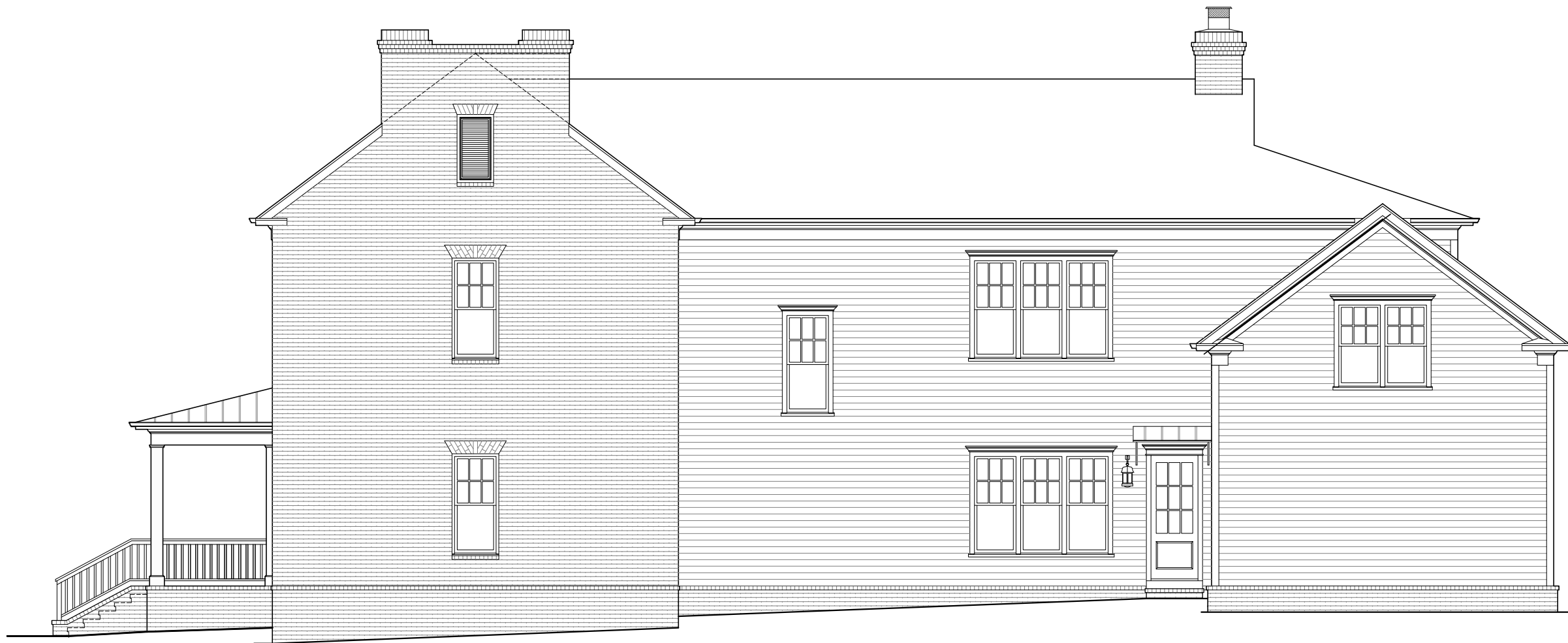
2 RIGHT ELEVATION 1/8" = 1'-0"