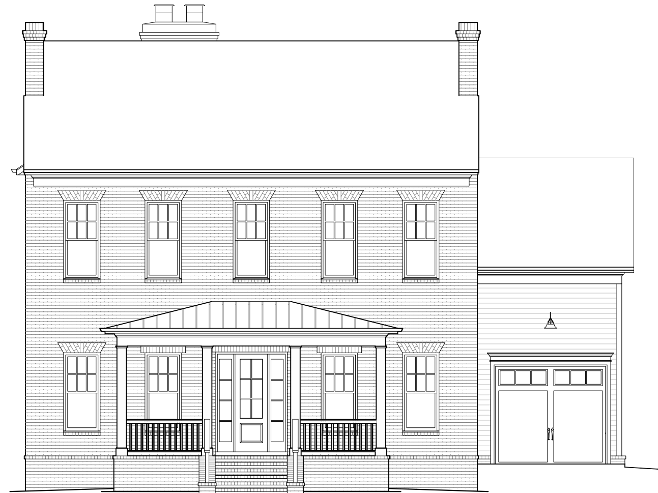
1 FRONT ELEVATION 1/8" = 1'-0"

SPLENDOR RIDGE LOT 009 149 SPLENDOR RIDGE DRIVE